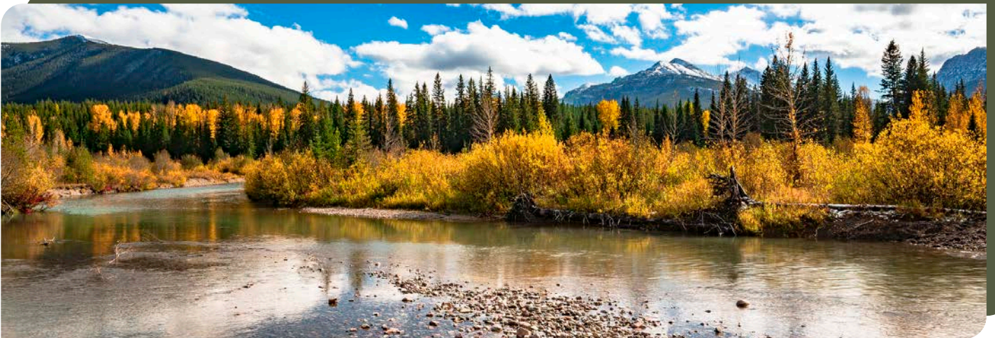
Flathead National Forest in Montana.

RVCC's network has voiced a need and an opportunity to improve recreation planning and management. As a coalition focused on promoting place-based solutions and community-based natural resource management, RVCC looks forward to contributing to and informing outdoor recreation planning, management, and policymaking conversations in a way that ensures the experiences of smaller rural communities are heard and represented.